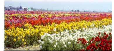
Ranunculus asiaticus grown in the Negev is exported to Europe.

Drip irrigation, soil solarisation and the use of industrial waste water to feed the agricultural landscape have made Israel's garden grow green and clean. Electro-magnetic water treatment has improved animal health and crop yields. Israeli-designed and manufactured computers coordinate daily farming activities with innovative equipment for the purpose of tilling, sowing and planting, harvesting and packing. Scientific research and development has resulted in biological insecticides, disease-resistant seeds and biological fertilization. In desert conditions specially adapted crops of citrus, avocado, mango, vegetables and flowers thrive. Two plant species were introduced twenty years ago; Jojoba, which produces oil seeds used in cosmetic production, and Opuntia, (sabras or prickly pear) a thornless cactus whose leaves serve as animal feed and whose fruit has a valuable market.