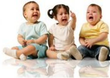
WIZO Early Age Division

On Thursday, 28 th February 2013, the Sderot Municipality, the Gvanim non profit organization and the WIZO movement inaugurated the Division for the Development of the Child in the 'Open House for the Early Age Group' in Sderot.