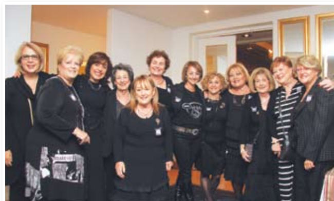
WIZO Johannesburg members

Having such large captive audiences, which consisted of both men and women, enabled WIZO South Africa to promote WIZO's work and the projects the federation supports in Israel and to raise much needed funds.