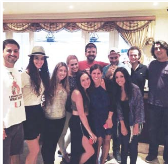
Raring to go! Atid Chapter's 20-somethings