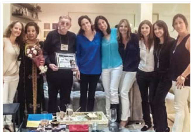
Holocaust survivors share their memories with WIZO Florida members

The saying 'from generation to generation' truly came to life when Holocaust survivors shared their histories and experiences with the next generations. The event, organised by Simcha and Ilanit Tikvah Chapters took place over the course of a few weeks and was hosted in more than ten homes, with a special night held just for teens.