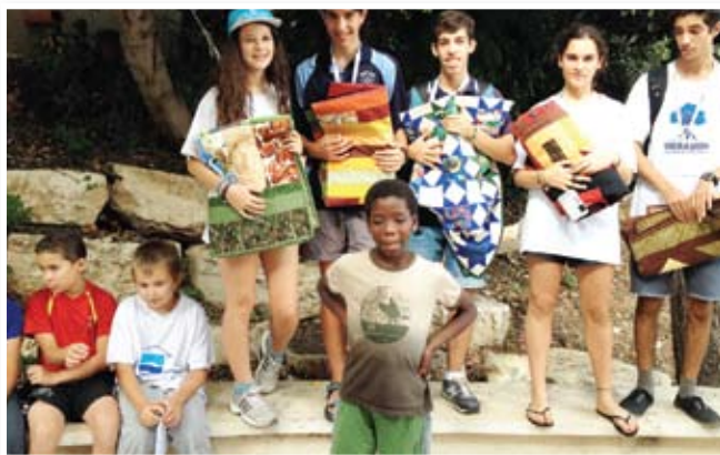
Carmel Shorashim group presenting quilts to the children at Ahuzat Yeladim