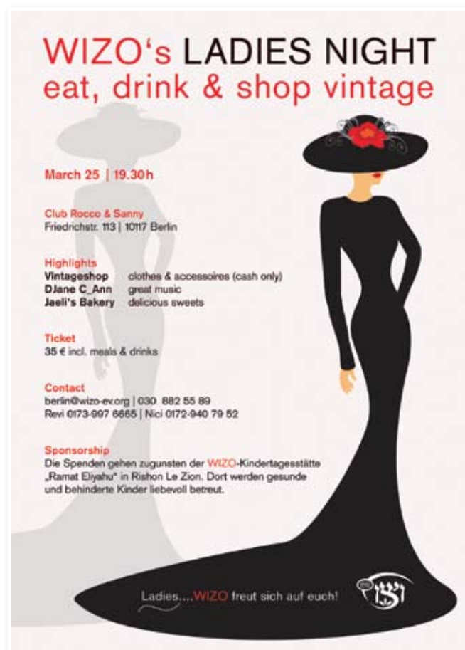
The elegant invitation to WIZO Berlin's Ladies' Night

Proceeds from the evening were dedicated to the Pilavin Day Care Centre in Rishon Le Zion, which is sponsored by WIZO Germany.