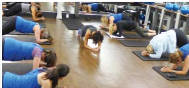
Tough workout! WIZO Westchester chaverot raising funds for WIZO's Emergency Campaign

The participants not only enjoyed a tough workout, they were also informed about the importance of WIZO's work during this war and the critical services being provided by WIZO to families from villages and kibbutzim in the south who were given shelter in WIZO's youth villages.