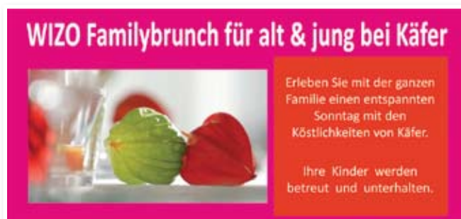
A glimpse of what is in store at Munich WIZO's Family Brunch

WIZO Munich once again held its popular annual family brunch at Käfer's famous restaurant. While eating the delicious and opulent buffet brunch, parents met together and mingled while the children were cared for and entertained by professional staff. All proceeds from the event go to WIZO Germany-sponsored Marie Sternberg Day Care Centre in Bat Yam.