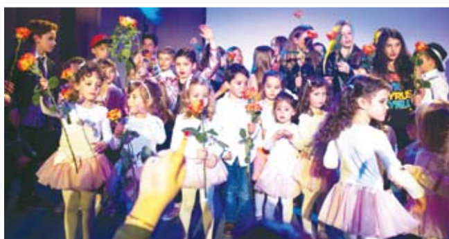
Delightful WIZO Berlin children!