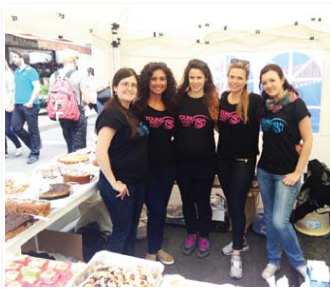
Young WIZO Frankfurt chaverot selling their homemade cakes

And last, but not least the girls sold homemade cakes at a popular street festival in Frankfurt. In a short time the 50 cakes were sold and funds raised surpassed that of last year.