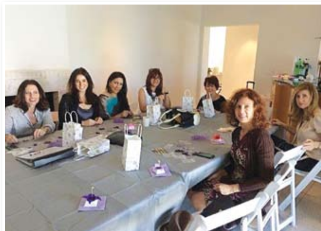
Yonit ladies using their creative skills to make jewellery