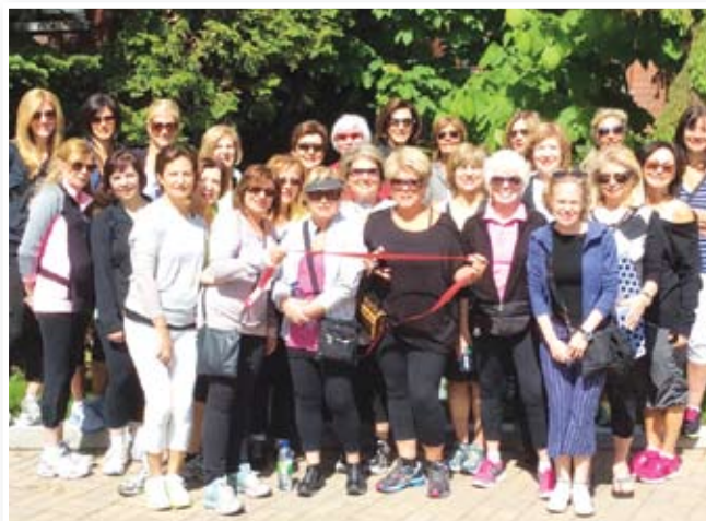
CHW Montreal Anna Zaitchick Chapter Walk in the Park group photo

Members and friends of the Anna Zaitchick Chapter of CHW Montreal took part in their 3rd annual fundraiser for CHW projects in support of Children, Healthcare and Women in Israel. Participants walked 5km on a scenic tour of Outremont and Pratt Park in solidarity with Israel and CHW. Each member set a minimum fundraising goal of $400 for themselves and most surpassed their goals! The walk was followed by a luncheon for all the walkers to celebrate their unbelievable success.