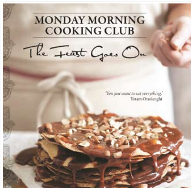
The Monday Morning Cooking Club new book 'The Feast Goes On'

The girls from Sydney who produced the wonderful Monday Morning Cooking Club cookbook in 2011 have just published their second book, The Feast Goes On . This features more of the best-loved, delicious recipes and stories from the heart and soul of Australia's Jewish community. The cook books are being sold in Australia by WIZO with The Monday Morning Cooking Club girls giving their time, energy and passion by attending events and launches.