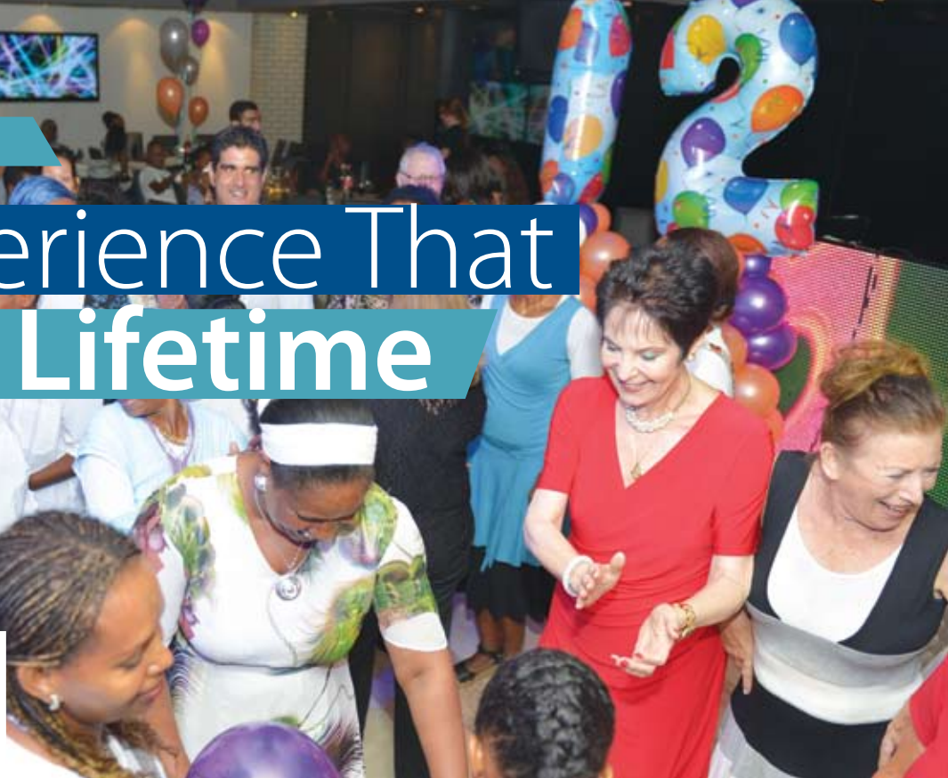
Bar/bat mitzvah celebrations at WIZO Afula Community Centre