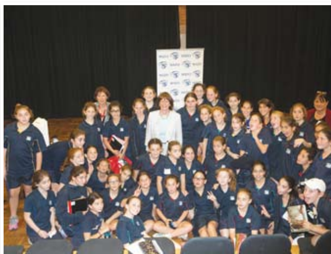
Moriah College 2014 Bat Mitzvah Girls

A tremendous effort was made by all the girls and WIZO NSW proudly watched on as the next generation of young women learnt about and supported WIZO's vital work in Israel.